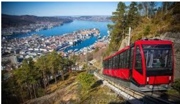
The Fløybanen funicular to mount Fløyen.

Bergen is known for its UNESCO World Heritage Site Bryggen, its mountains and its rainy days. We currently hold the record for the most rain in one month, with 634,7 millimeters of rainfall during October 2021. That means that when the sun actually shines, the city centre is vibrant and crowded with people. Everyone usually puts everything else on hold and goes out to enjoy the sunny weather.